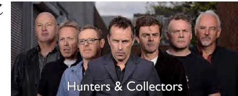
Hunters & Collectors

We may never meet again, so, Shed your skin & let's get started. You will throw, your arms around me.