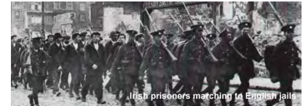
Irish prisoners marching to English jails

Oh-ro, shey do vaha wohlya Oh-ro, shey do vaha wohlya Oh-ro, shey do vaha wohlya Anish air hakht ahn tao-rig.